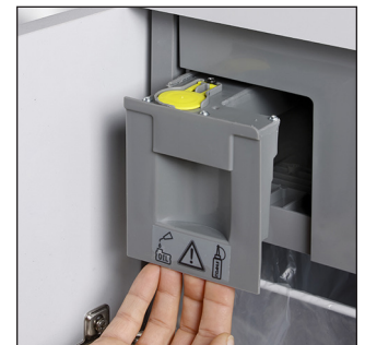
The EvenFlow Lubricator automatic oiler provides slow, continuous lubrication and ensures peak performance.