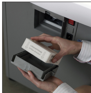
The DAHLE CleanTEC® filter traps up to 98% of the fine dust and provides a healthier work environment.