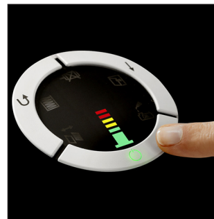
The easy-to-use command dial controls all of the shredder's functions and illuminates the proximity to sheet capacity.