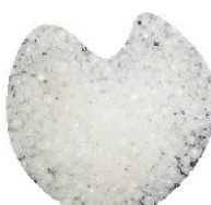
LDPE FILM 薄膜