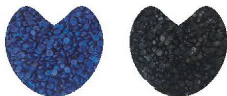
HDPE BAG PUNCHING PARTS