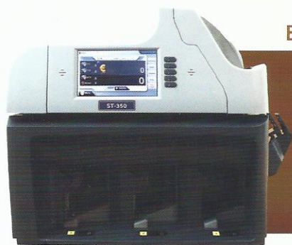
Banknote Processing Machine